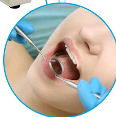
MSV 6/08 - Bestseller